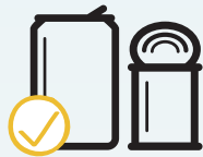
Aluminium and tin cans