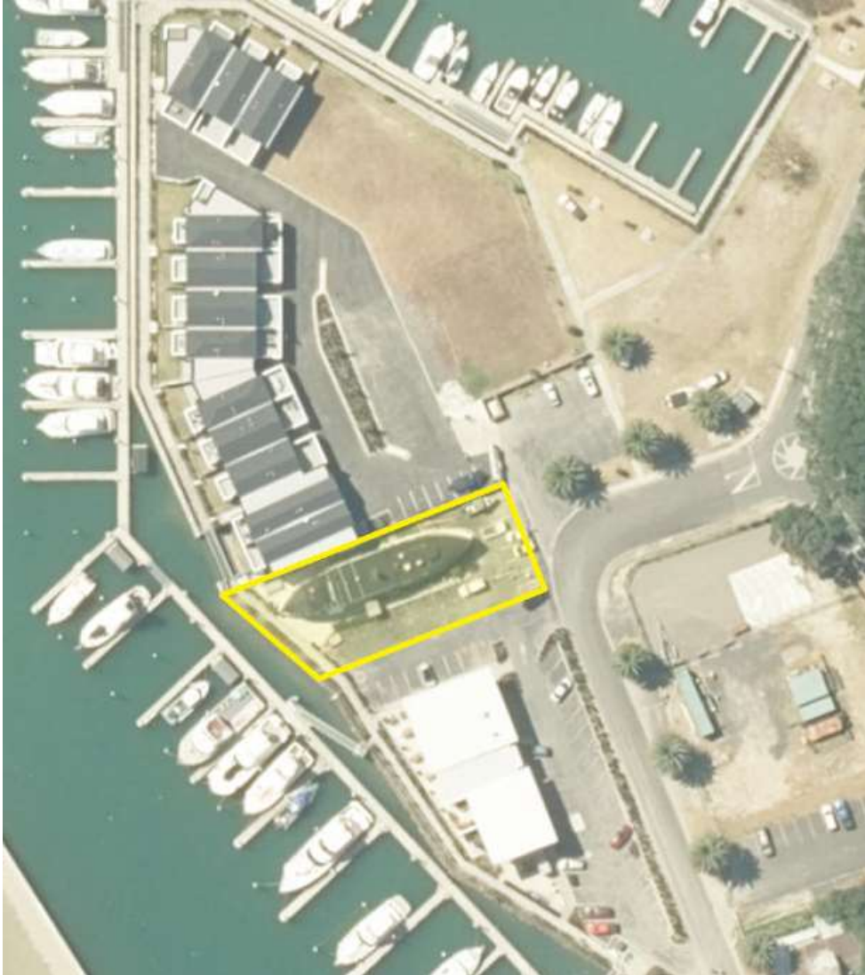
Aerial of Subject Site and Surrounds.